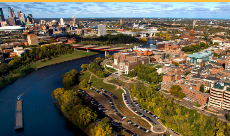
The University of Minnesota Medical School is located on the Twin Cities campus.

drug action, and identify new molecular targets for therapeutic development. These pursuits are critical for improving our ability to treat cancer, infectious disease, neurological disorders, and cardiovascular disease, and other medical problems.