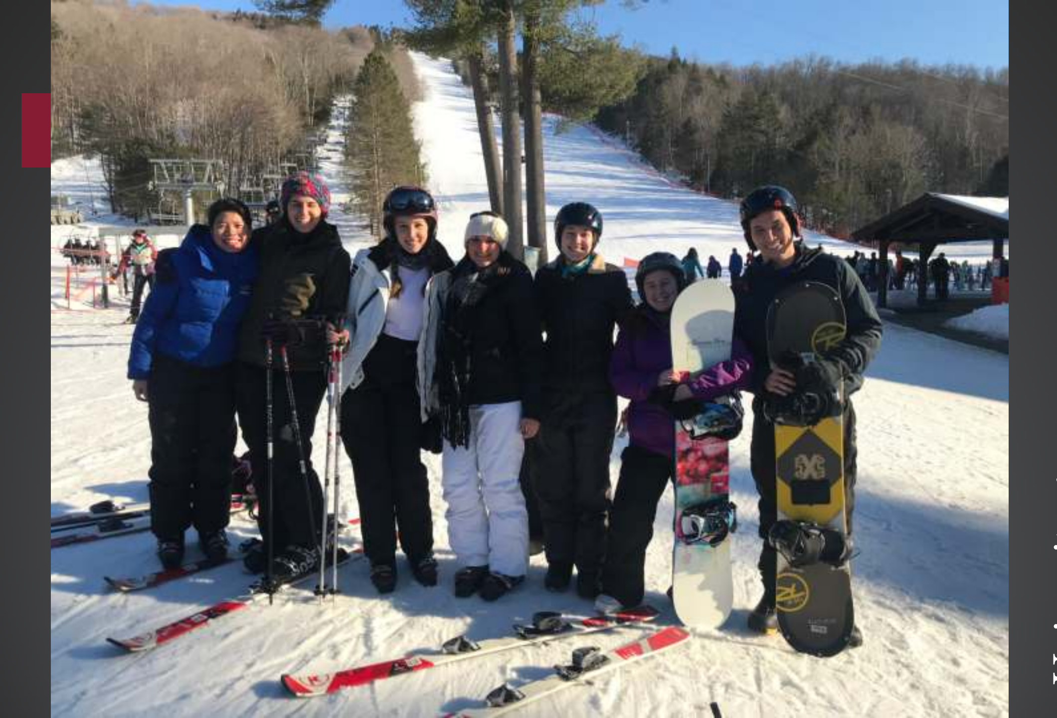
University of Massachusetts Amherst