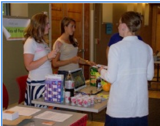
Politics of Food students share their research