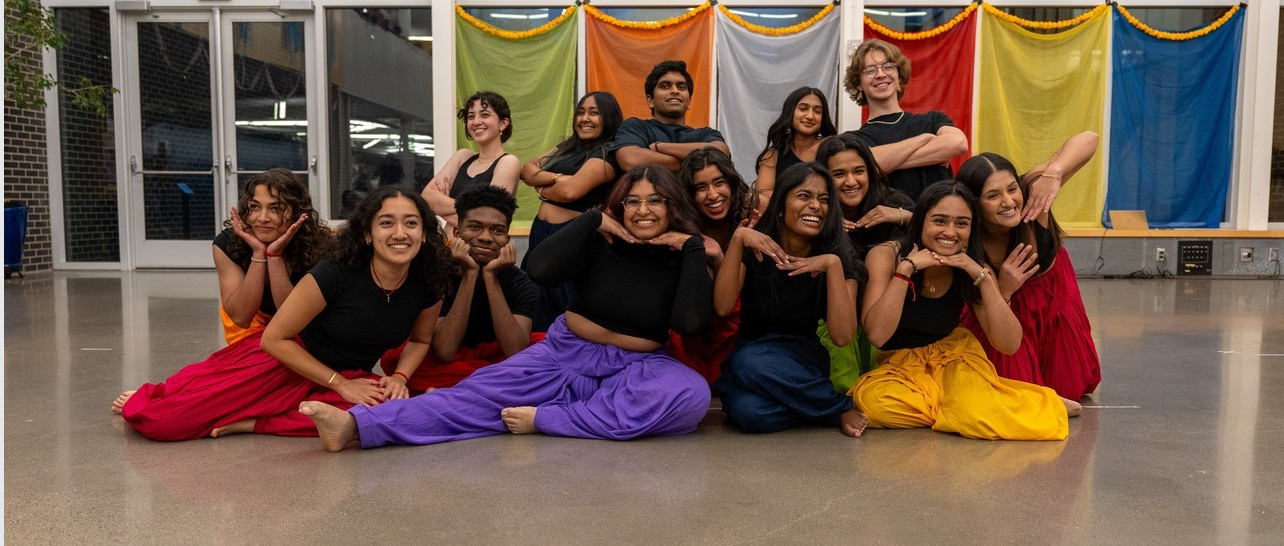
Student performers at campus Diwali celebration.