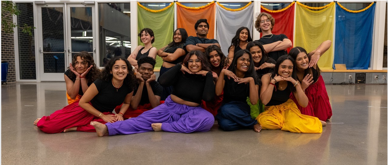
Student performers at campus Diwali celebration.