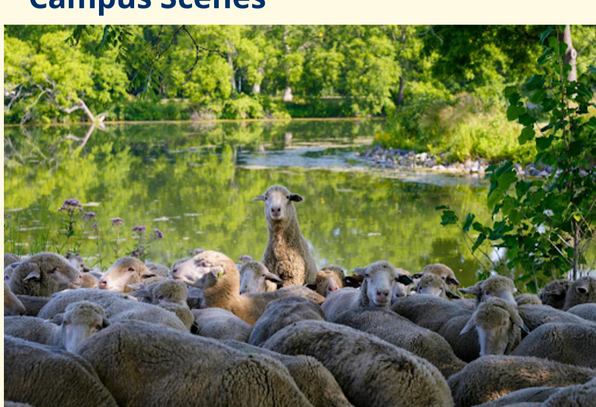
Our usual invasive-species-munching goats are relaxing elsewhere this summer, so this week we've got sheep taking care of some plants by Lyman Lakes!