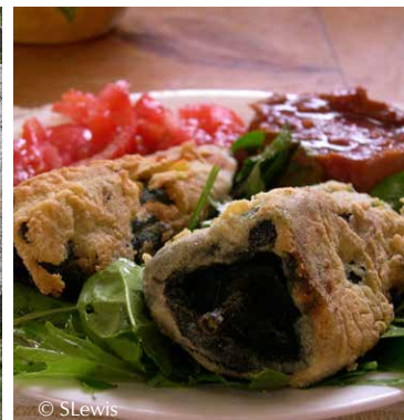
Above (from left) woven baskets; Ria Celestún Biosphere Reserve; Chichén Itzá; chiles rellenos, a traditional local food