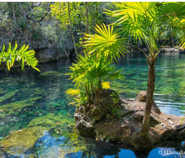
Above (top to bottom): Black spiny-tailed iguana, Izamal Convent, traditional dishes, cenote