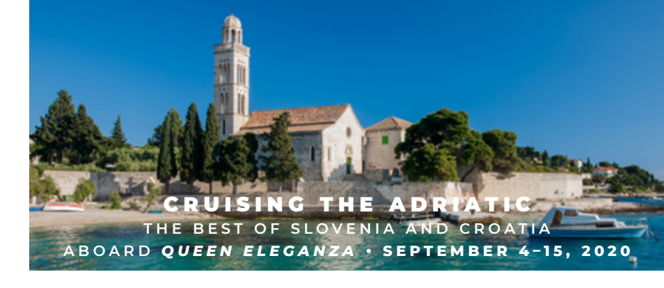
PHOTO CREDITS (FROM DREAMSTIME.COM) COVER Dubrovnik ; Dubrovnik ; Pula ; Palace of the Emperor Diocletian ; Ljubljana ; Rovinj ; Zadar ; Trogir ; Hvar ; Portorož ; Lipizzaner Horses ; Split ; Dubrovnik ; Croatian Harbor

California Seller of Travel Program CST #2088800-40