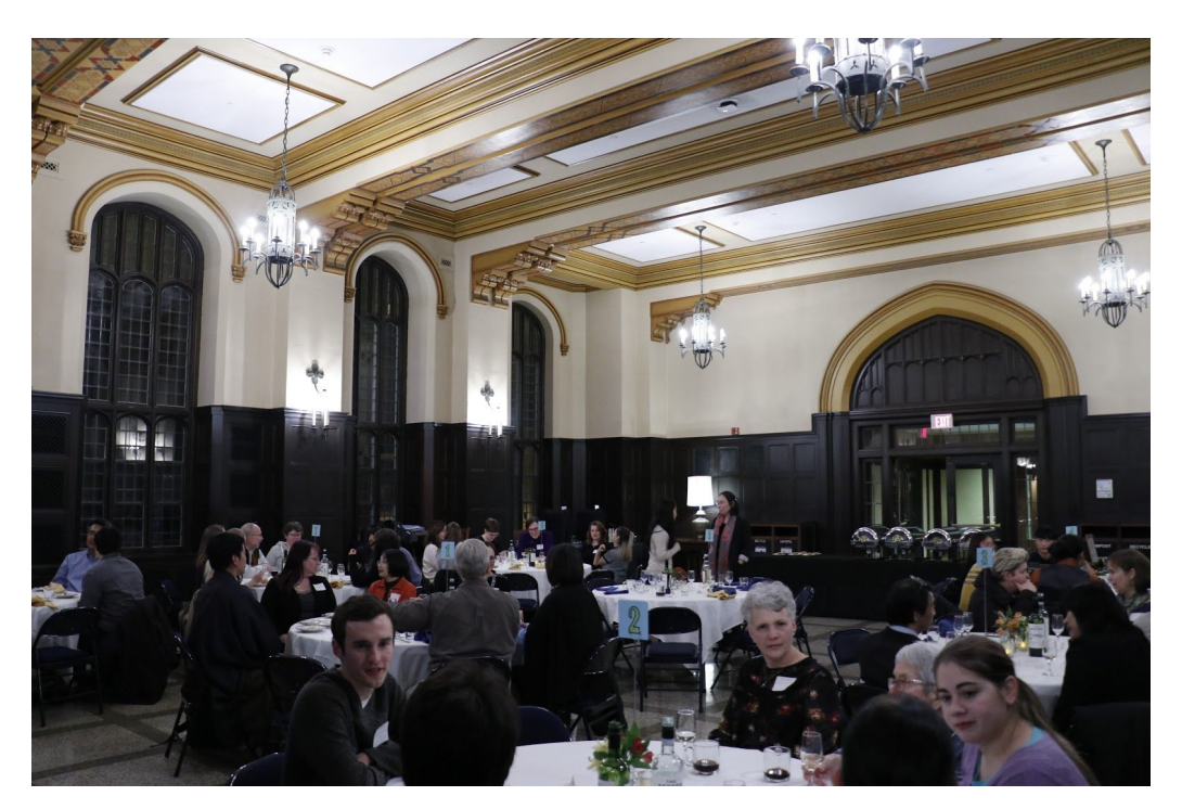
A delightful dinner in the Great Hall followed the talk.