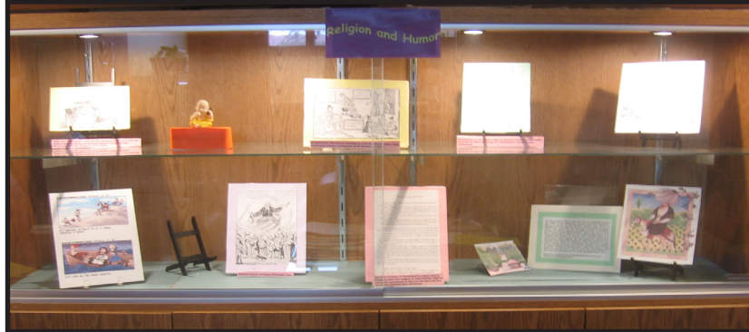
Spring '07 display case

material realm without slipping on some sort of transcendent banana peel, and we are probably better off not trying overly hard to stifle our giggles. ■