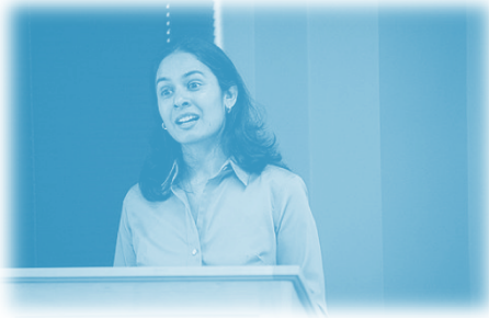
This year's Foro was held in Boliou and the Athenaeum, addressing political transitions in Venezuela.