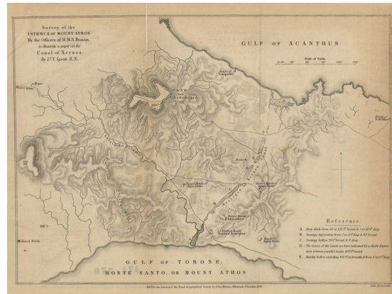
Figure 2: Map of Spratt's survey of the Isthmus of Mount Athos, drafted by John Arrow-smith. Spratt, "Remarks on the Isthmus of Mount Athos," map between pages 145 and 146.

Although Spratt's investigation of the Canal of Xerxes might have concluded a series of geographical survey at the isthmus, British military explorers continuously ventured into the Holy Mountain even after 1840. Their accounts took up and responded to issues raised by previous